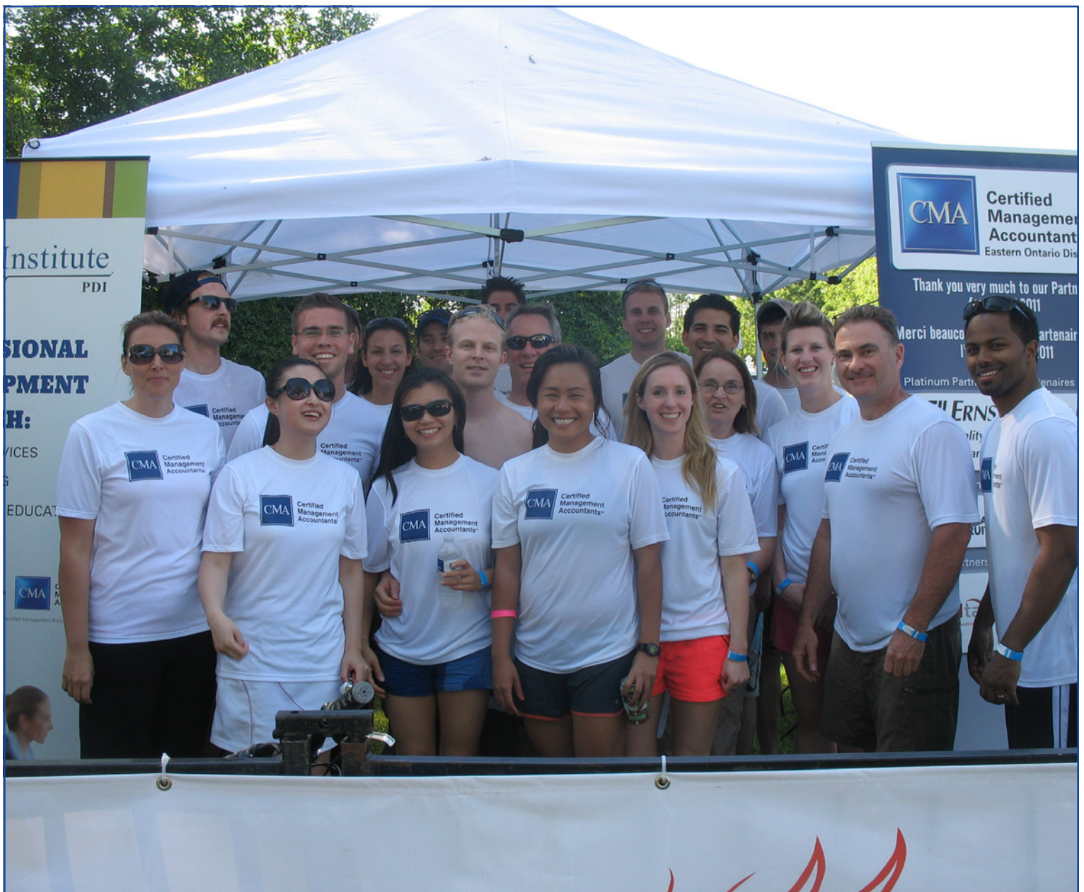
Dragon Boat Festival paddlers in front our site for the day – congratulations to all paddlers and supporters on what was one of the most enjoyable events I've attended

The objective of this event was to have fun and to end the year on a positive note – thanks to great attitudes and teamwork it was mission accomplished!